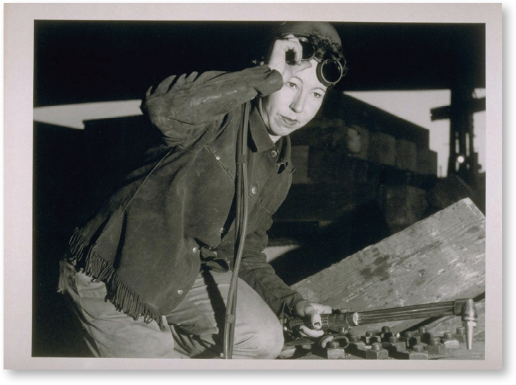
TITLE: Women employees performing various jobs from the Women in the Workforce collection

Similar undertakings include the Public Library of Science (PLoS), which publishes cutting-edge professional journals in the fields of biology and medicine, and the Library of Congress' Serial and Government Publications Division program, which is digitizing 30 million pages from newspapers covering the period from 1836 to 1922. All of these materials are available for free use and repurposing for educational and other purposes.